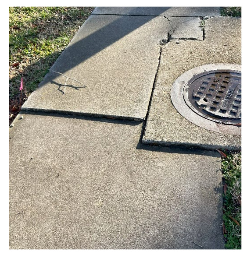
Item 3 – Deterioration of curb in front of The Local at 4337 Irvington Road (From 2023). VDOT

Item 2: Slab on King Carter Drive next to manhole in front of Steamboat Era Museum is shifting and cracking (New) VDOT