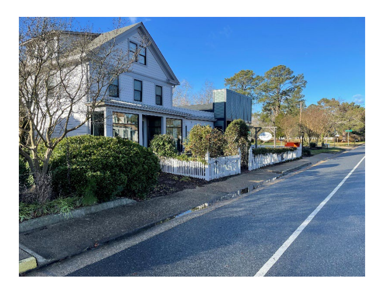
Item 8 – Slab heave to right of driveway for 26 Steamboat Road. (New) Town

Item 7: Two driveway cuts inconsistent with building type. Recent reports of pedestrian tripping / safety issues. (New) VDOT